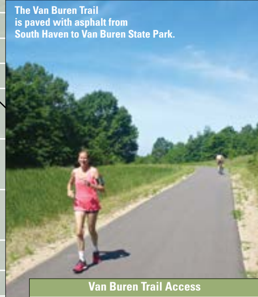
Van Buren Trail Access